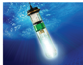
XPV875W "eco" For external box