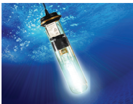
XPV1000W For external box