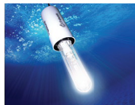
IPV1000W Integrated. Magnetic / Digital