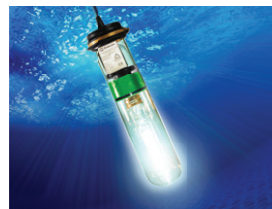
IPV875W "eco" Integrated. Magnetic / Digital