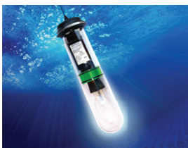
XPV365W "eco" Integrated